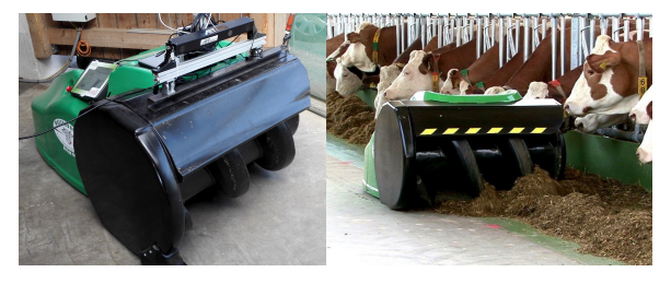
Fig. 1: Target robot platform for feeding with front-facing stereo camera system.