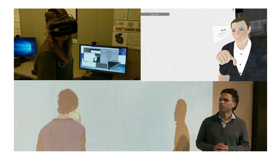
Fig. 1. A remote-student looking at the avatar of a teacher in VR, and the teacher looking at the avatar of the remote student projected onto the whiteboard.

We believe that while immersive technologies will play an increasing role in both online and face-to-face learning, they also have the potential to address many of the issues with remote learning. To support that claim, we design and implement a prototype of a system that brings the online instructor and the remote student back together. The system also addresses the issue of low-bandwidth Internet connection. We call our prototype system UniVResity.