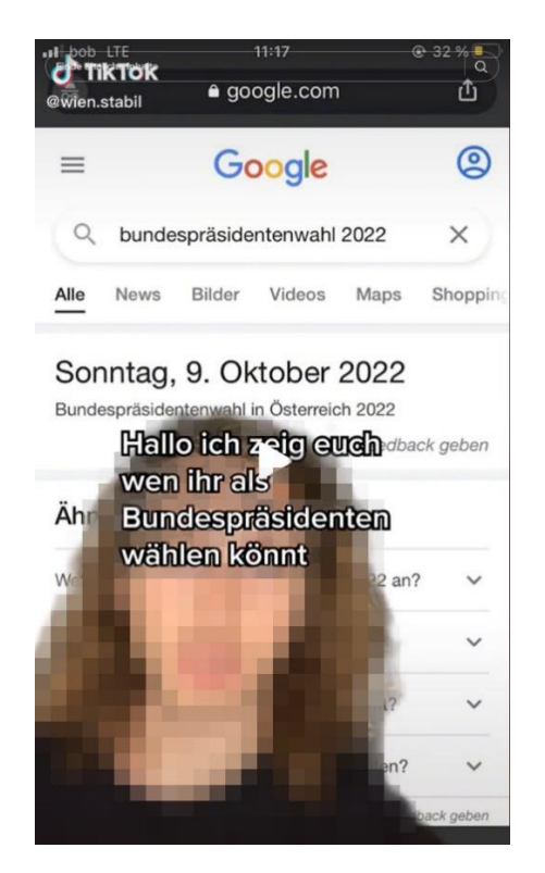
Figure 4: Screenshot of contributions regarding the presidential elections in Austria on wien.stabil (wien.stabil, 2022; person made unrecognisable afterwards )

Production conditions are likely to drive other format decisions: Street interviews are easy to conduct and, combined with the deliberate selection of audio clips, can quickly generate laughter. The best way to combine journalistic standards with platform-specific entertainment is through well-researched but quickly edited montage videos, such as a series on the Austrian presidential election. This shows the consistent 'internet logic' of the content, with each segment starting with a web search, followed by a rapid succession of audio and video snippets and images, often sarcastically commented on with internet memes (see Figure 4). What does not seem to have been abandoned here is a critical and investigative approach to journalism, evident in the critical questioning of each candidate's campaign priorities. In addition, comedy or sketch formats are typical of the platform, where even serious topics such as COVID-19 are treated as pranks.