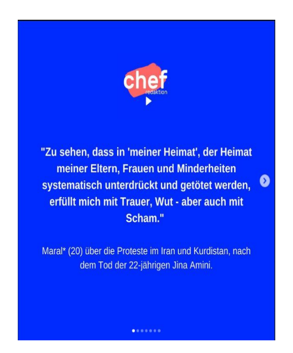
Figure 2: 'Seeing that in "my homeland", the homeland of my parents, women and minorities are systematically oppressed and killed fills me with sadness, anger - but also shame.' - First info slide on a post on the Iran uprising, written by an author with Iranian roots (die_chefredaktion, 2022b).

Regarding the overarching mediation styles of die_chefredaktion , we identified a break with norms of journalistic objectivity. While in a traditional understanding the abstraction of the journalist from the story and a 'balanced reporting' are seen as ideals (Blaagaard, 2013), many contributions focus on subjective concerns and emotionalisations of those reporting. This can be seen in Figure 2 where an author with Iranian roots describes her feelings about the Iranian uprising in 2022.