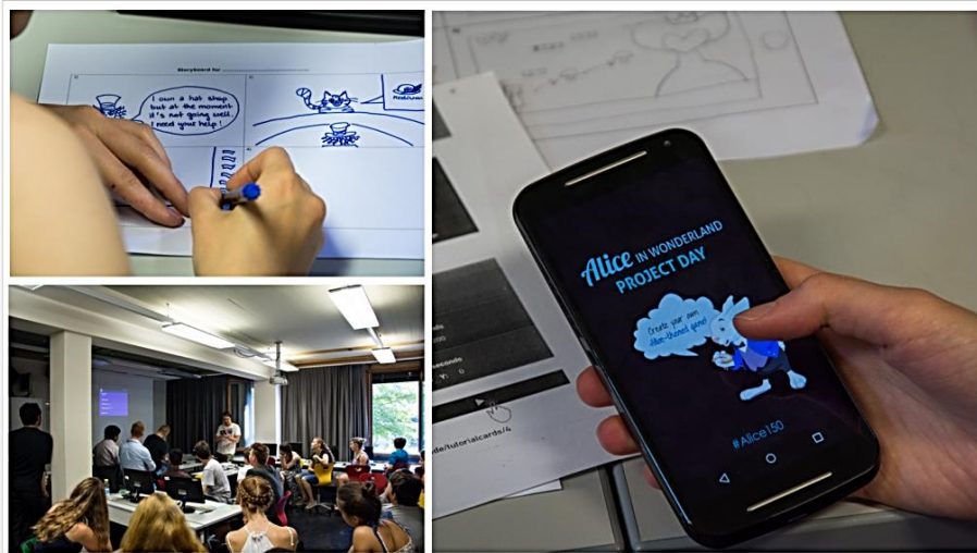
Figure 3. Pictures of the workshop: storyboard, instruction session and framework “Shape of a Game”.

The introduction session was held in front of the whole class to show what could be achieved within Pocket Code, with the team presenting example games and the user interface. Afterwards the students formed groups of two or three and pitched game ideas. These ideas were shared with the class and the students got direct feedback. Next, the students created storyboards which helped them to get a clearer image of the gameplay and characters. Without giving them further guidance in programming, they started to code their games. The team took the role of coaches, and students could consult them when they needed some input. This learning by doing approach supports the constructionist theory, and most importantly students had the opportunity to add their creativity to this session and explore the various functionalities of Pocket Code on their own. Figure 3 illustrates different impressions of the workshop. At the end they uploaded their games to our web share page 8 and presented them in front of their peers.