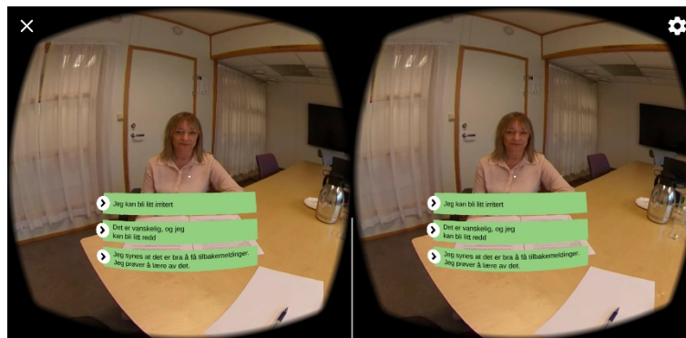
Fig. 2. Possible directions for developing an answer

of the questions (videos) based on several multiple-choice questions the app asks before starting the interview (e.g., about education and work experience) and based on the duration of the answer (e.g., if the answer time is shorter than a certain value a follow-up question is added). We also had questions where the user was given a hint in the form of three possible directions for developing an answer (Fig. 2). In these situations, the scenario develops further based on the chosen direction.