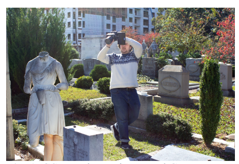
Fig. 1. GSU student using a Red Camera to experiment with photogrammetry.

Historic Oakland Cemetery is one of Atlanta's oldest burial spaces and public parks. Working with the Historic Oakland Foundation, Georgia State University, Emory University, and Beam Imagination are creating an experimental, collaborative, and public-facing digital archiving project that combines maps, a burial database, 3D visualizations, and data curation. The project is an example of what Ed Ayers has called generative scholarship , as it is "built to generate, as it is used , new questions, evidence, conclusions, and audiences" and "offers scholarly interpretation in multiple forms as it is being built"[1]. The project will serve as a platform for connecting community storytelling, experiential learning and research projects at K-12 and higher education institutions, game development, walking tours, and archaeological findings.