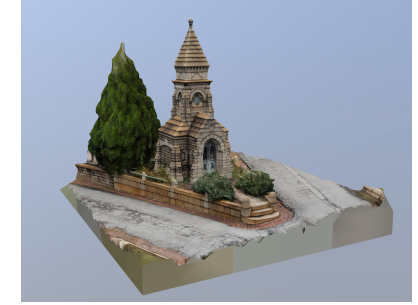
Fig. 3. Burial record on Omeka map