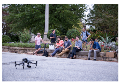
Fig. 2. GSU and Emory faculty and students working with Beam to create drone map.