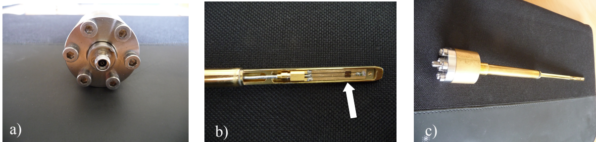
Figure 1. The newly developed RF-holder for the investigation of gyrotropic motion. a) Waveguide connection to the RF-generator which allows us to apply frequencies in the MHz range. b) Tip of the holder, including the circuit board, shaped as a wave guide, with the specimen (see arrow) mounted in place. c) The fully assembled RF-holder.