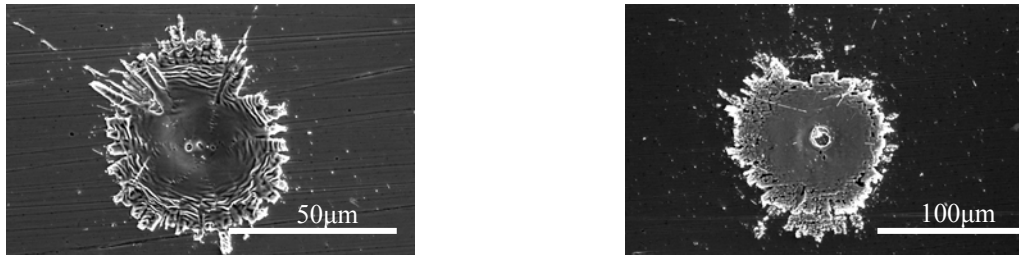
Figure 1. SEM images of typical fully melted splats