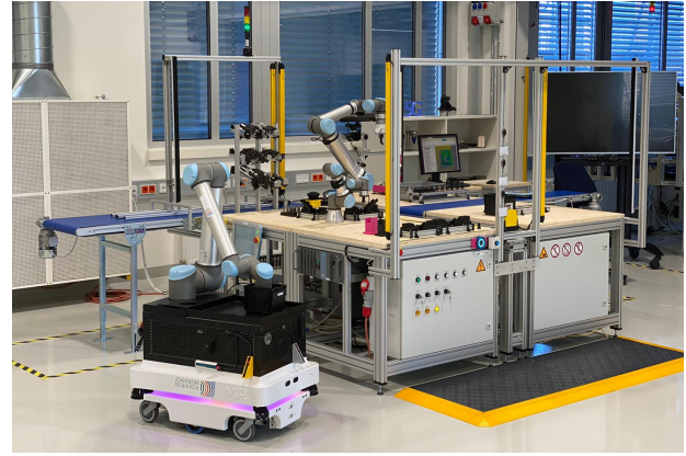
Figure 3. Setup of the use case in lab environment.

Impact of Resource Allocation The modification space related to the given resources spans all possibilities between manual processing to an almost fully automated scenario. Special safety considerations are relevant for those cases where a robot is allocated to a task. For this purpose, all boundary cases must be evaluated separately for e.g. critical contact situations, safety distances as well as force and pressure impacts on the involved body regions of the human. This can lead to restrictions which are stored as a set of rules for a partially automated assessment.