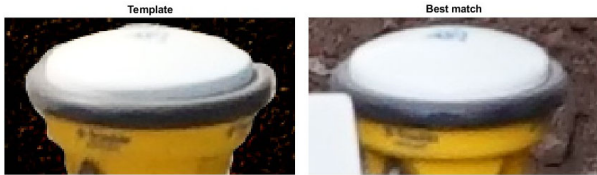
Figure 2. Template of the GNSS antenna (left) and best position found in the right image.

proved due to bad GNSS quality or if there are antenna positions missing due to GNSS outages and need to be derived from VO solely. It is important that there are GNSS positions available before and after an outage has occurred to ensure that the VO trajectory is correctly oriented and placed w.r.t. the defined coordinate system (UTM). One issue that had to be solved is to mask out all areas in the stereo images covered by the tractor or milling machine itself as this would deteriorate the VO process significantly and often caused complete fail of the VO solution.