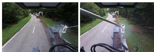
Figure 1. Example for a left and right camera view of the LAYJET camera system during operation.

VO is perfectly suited to reconstruct the trajectory of (very) slow moving vehicles as the LAYJET tractor as the drift error is dependent only on distance but not on time (as it is the case for Inertial Measurement Units (IMU)). Using a calibrated stereo camera system also allows determining the scale correctly without additional measurements [4]. In the following we describe the camera system and the implemented VO workflow and show first results from a LAYJET production run.