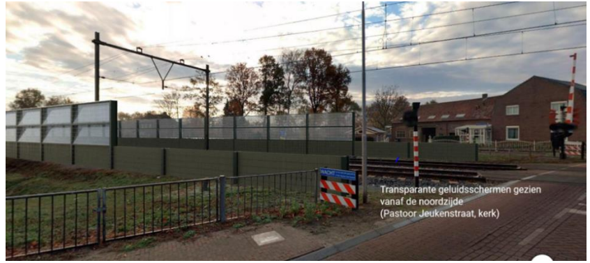
Figure 2 Example of a visualization: transparent screens at railway crossing

and presented these on their website to the villagers