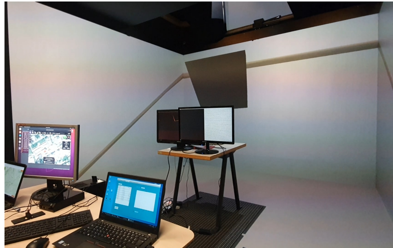
Figure 4. An abstracted environment, e.g., consisting only of the horizon and a box, can be used to test the basic functionality of the collision avoidance algorithm.

There is a clear case for the increased use of VR testing based on experience gained in VR-based product testing. In virtual realities, a wide variety of scenarios can be reproducibly run through—with automatic testing even 24/7. This automatic testing under almost realistic conditions is otherwise not possible. Furthermore, the level of realism can be reduced to a minimum. Such a minimalist scene with only a plane and a box is shown in Figure 4. This reduction enables the efficient debugging and testing of subsystems that would be difficult to test in reality (see Figure 3).