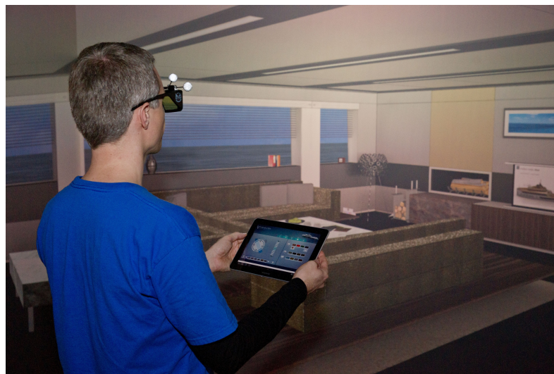
Figure 1. The “usual” test case for a virtual reality environment is a product evaluation, i.e., inspecting and evaluating a product such as a building, a car, a yacht, etc., in order to obtain a realistic impression of the final product.

All of these points, especially the reduced development time and elimination of the hazard potential of developed prototypes, are the foundation of the hypothesis investigated.